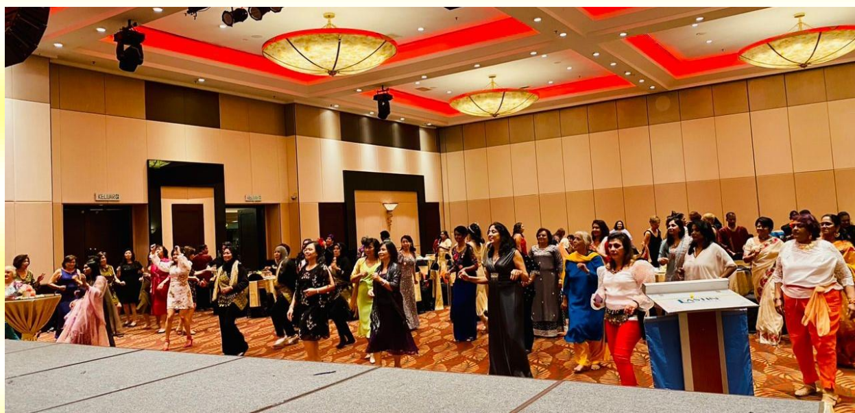
Dancing the night away in Inner Wheel Friendship