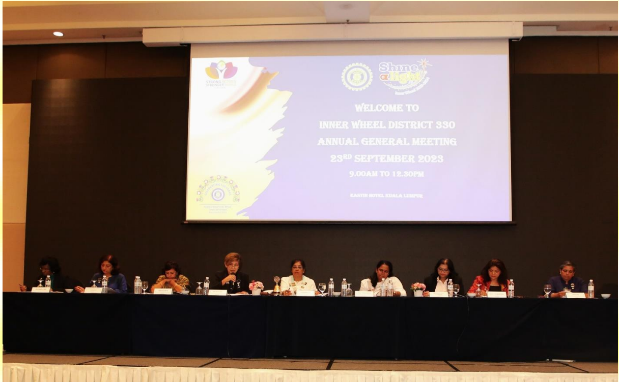
The District Committee at the 43 rd DAGM of IW District 330