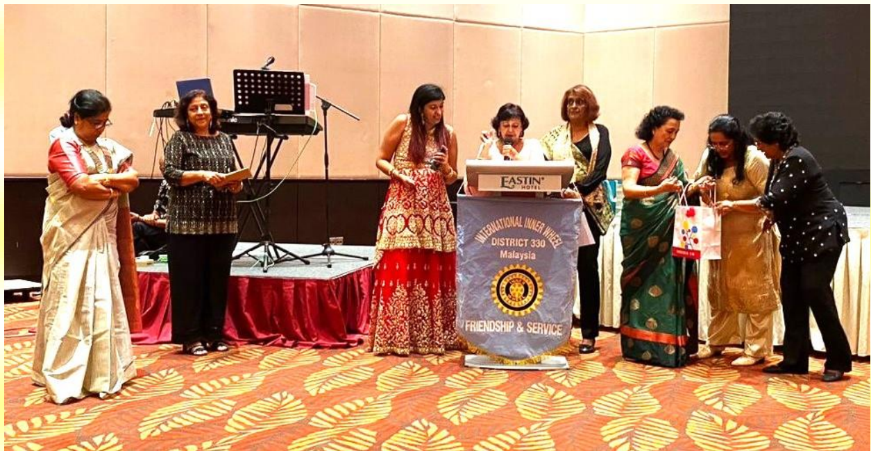
ISOs and friends at work during the Friendship Night's Scavenger Hunt