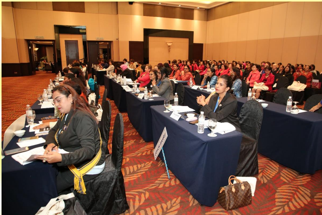
Club delegates and observers at the AGM