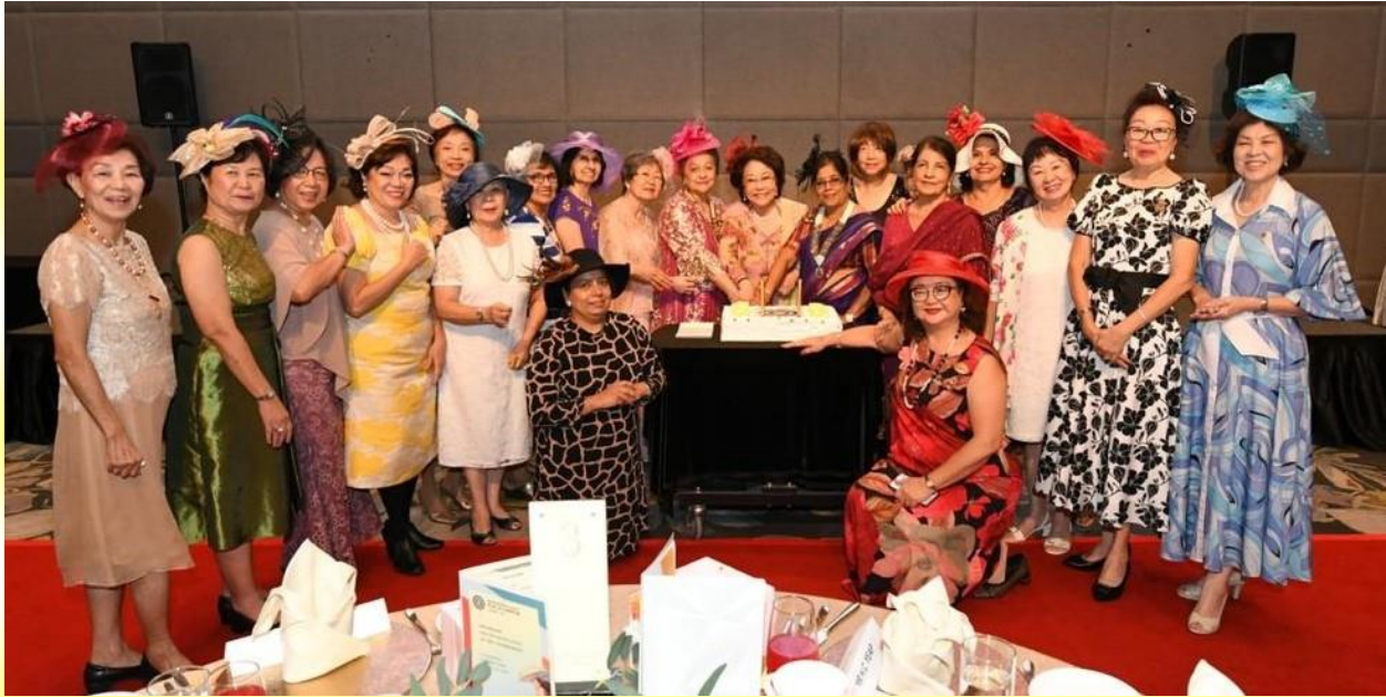
DC Kamala (in purple saree) at the Royal Ascot themed installation of IWC Kuala Lumpur which was attended by the District Exco as well.